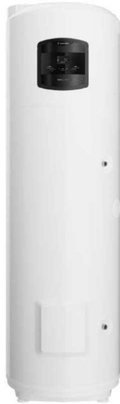
200L Direct/250L Indirect

The renewable heat pump technology used by Nuos Plus Wi-Fi converts air into energy for domestic hot water, ensuring energy savings of up to 80% compared to traditional direct cylinders of the same capacity.