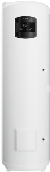
200L Direct/250L Indirect