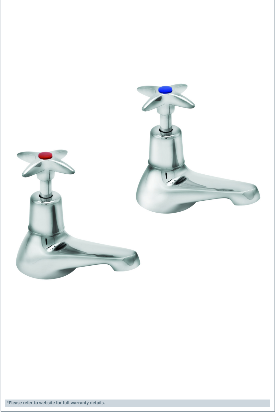
Flow (Bar - I/min, open outlet)