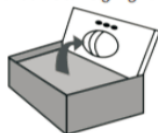
Remove vanity from box VERTICALLY!