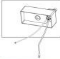
Step 4: Connect hot & cold water hose to the tap and connect the other end to outlet of the valves.