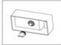
Step 2: Fit the Silicone sleeve on the bottom of the waste.