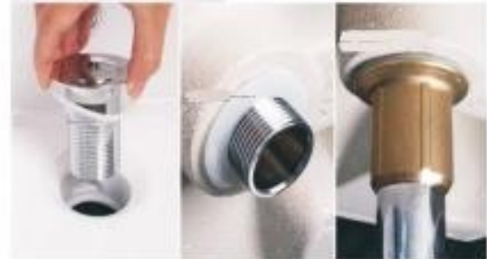
1. Fixed the filter first and put in the hole