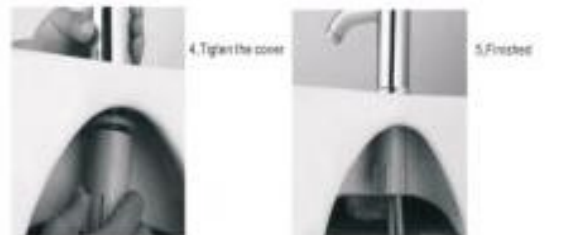
4. Tighten the cover