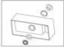
Step 1: Place and fix the waste and washer.