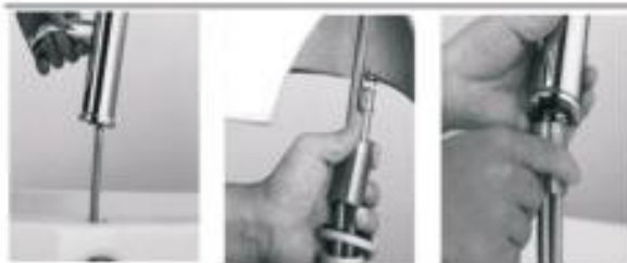
1. Fixed with one of flex pipe