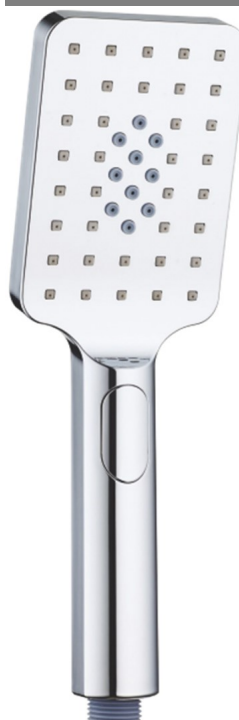
SELECT BUTTON TECHNOLOGY